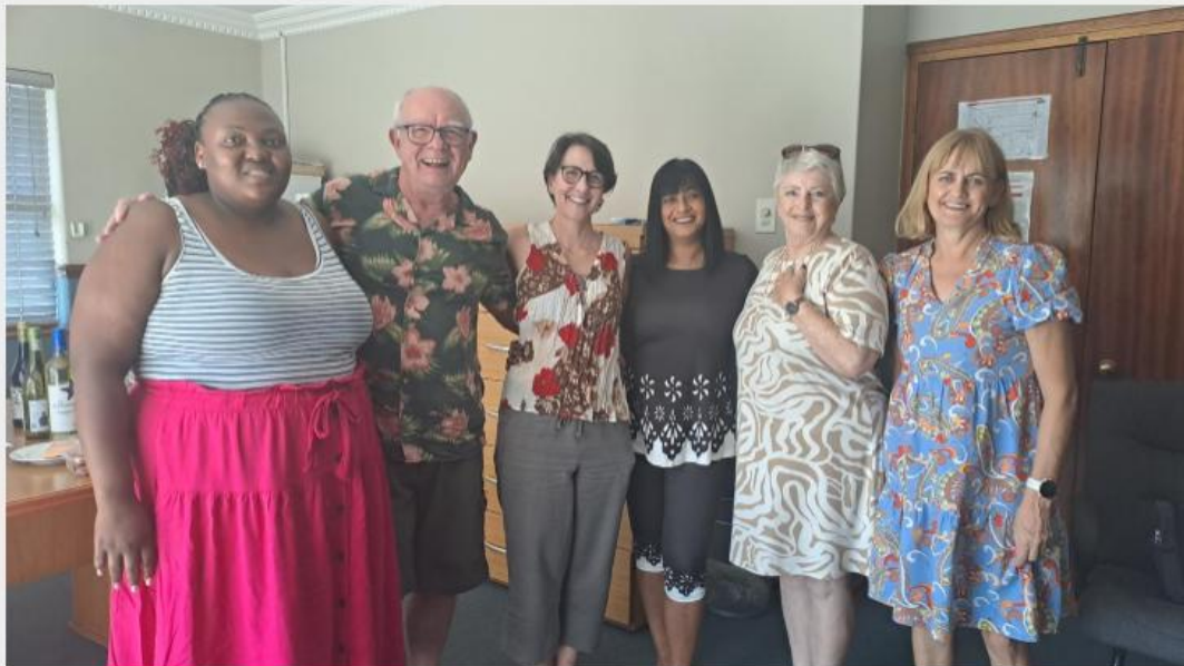
SADASA committee 2025